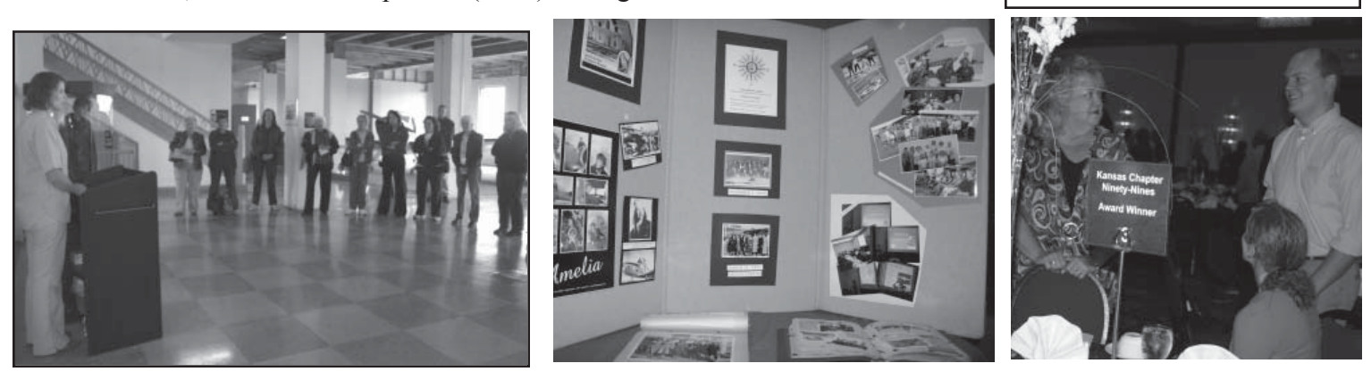
South Central Section APPROACH • Spring 2010