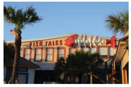
Fish Tails Restaurant