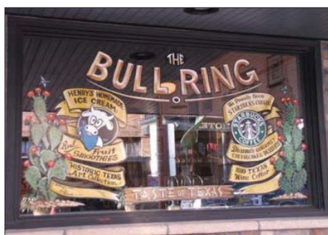
Bull Ring - Downtown Ft. Worth-Stockyards