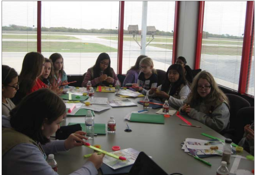
Cadettes Using Play-Doh and Rulers for Weight and Balance Exercise