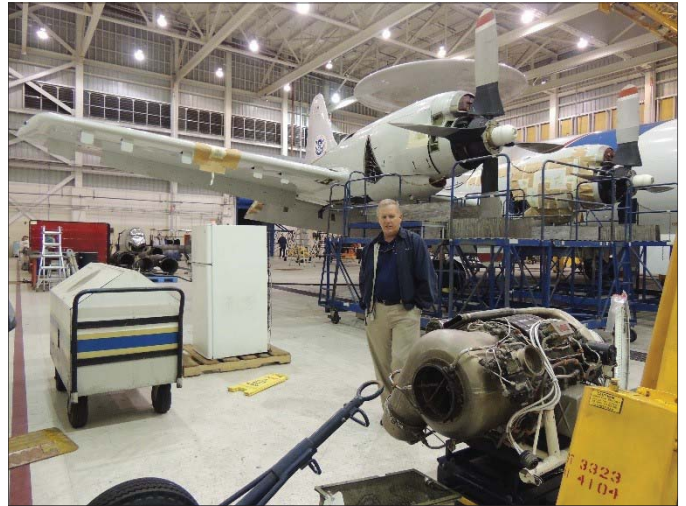
Lockheed P-3 Orion in the shop