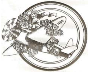
Texas Dogwood 99s

The Official Publication of the South Central Section of The Ninety-Nines, Inc. Spring 2014 • Vol. XXX No. 1