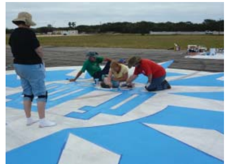
Getting the last pieces painted