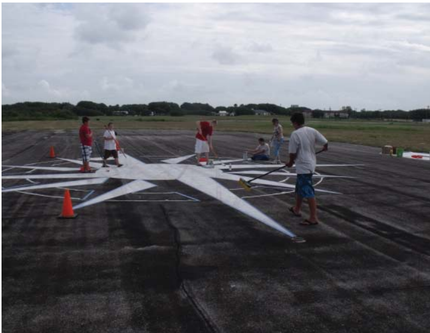
Boy Scouts put on the 2nd coat of white