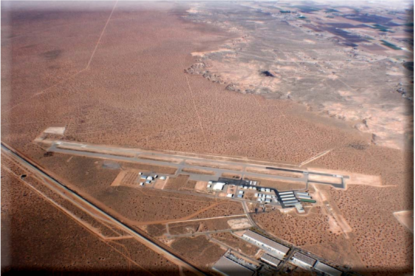
Dona Ana County Airport (5T6) - Santa Teresa, NM

The Official Publication of the South Central Section of The Ninety-Nines, Inc. Fall 2012 • Vol. XXVIII No. 2